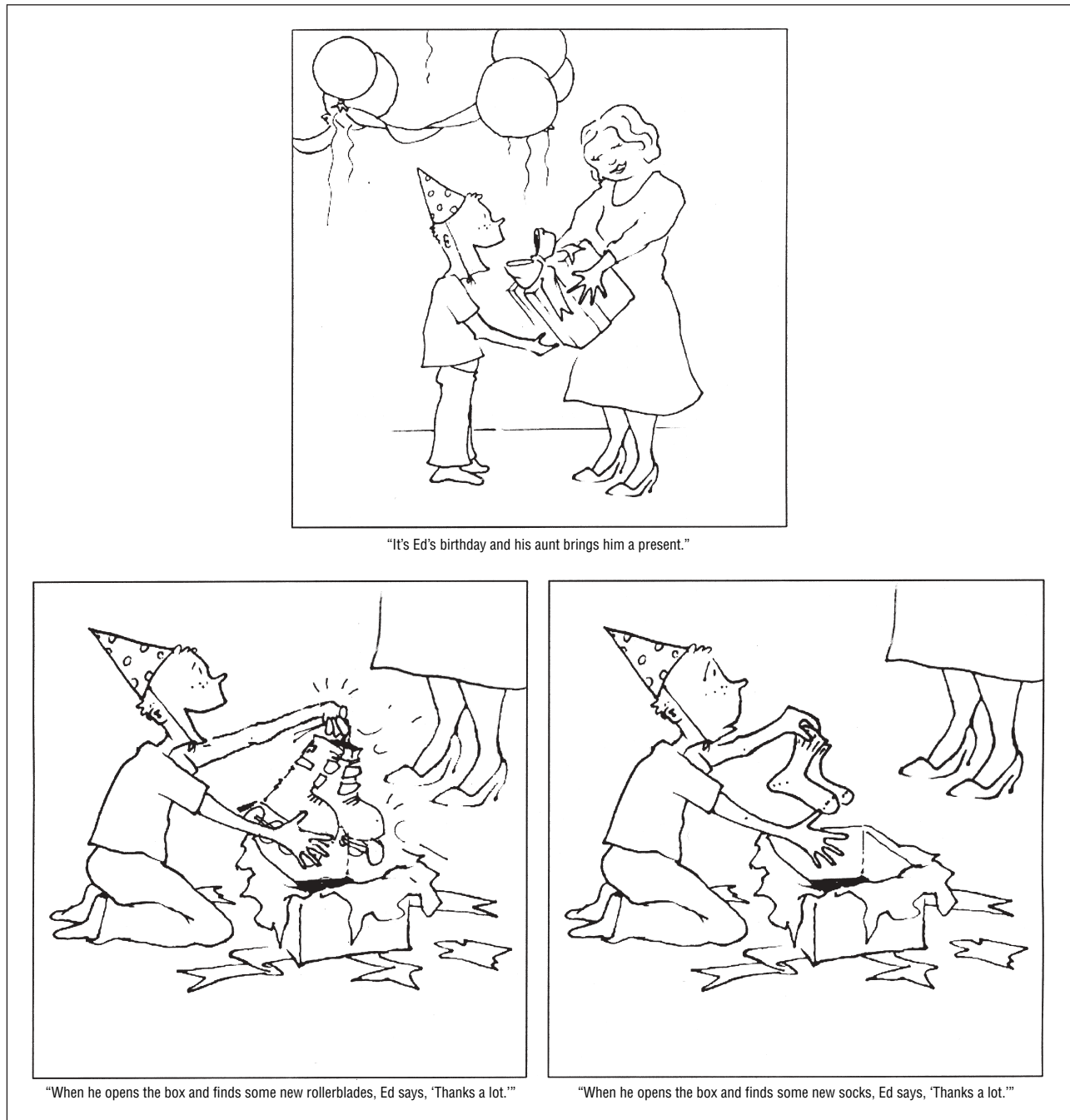
Figure 1. Example scenario. The setup (top) is shared by both the sincere and ironic versions of the scenario. The sincere ending is shown at the bottom left, and the ironic ending is displayed at the bottom right. The text below the drawings represents the accompanying auditory stimuli. Participants view the setup first, then either the sincere or ironic version of a scenario, followed by a blank screen and the question, "Did Ed mean what he said?"

though the mean verbal IQ (VIQ) was higher in TD children than in children with ASD ( t_{1,34}=2.9, P=.007, \text{Cohen } d>0.90 ; for all other comparisons, P>.10 ). Seven participants with ASD were receiving psychotropic medications (including selective serotonin reuptake inhibitors, stimulants, and new-generation neuroleptics). We performed all of the analyses without these subjects and found that the pattern of results remained the same. As such, we report the findings with the full sample of 18 subjects in each group. Participants and their parents gave written informed consent to participate in the study according to the guidelines of the institutional review board. Subjects were paid $25 per hour (up to $75) for participating.